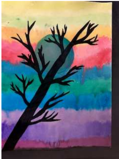
Talented Artist at JKE